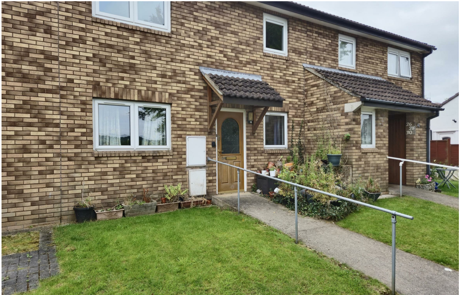
24, HEATHFIELD WAY, NAILSEA, BS48 1ED £135,000